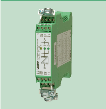
RS-485 interface repeater DI-1PSM