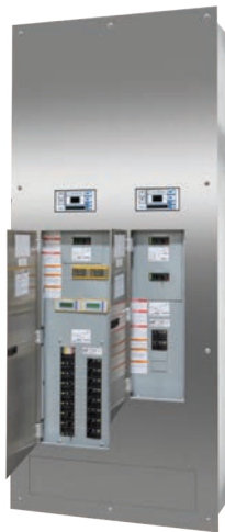
Dual output voltage panels