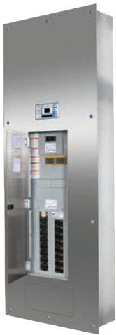
Standard isolated power panels