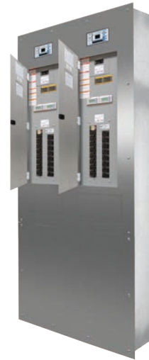
Dual system panels