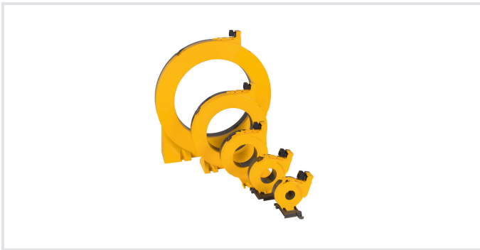
CTAC series Current Transformers