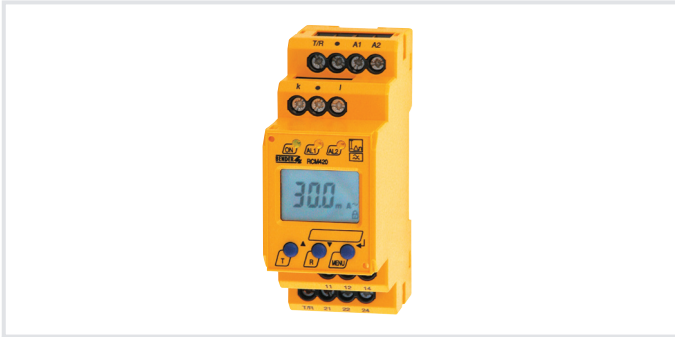
RCM420 series ground fault monitor - MG-1.3