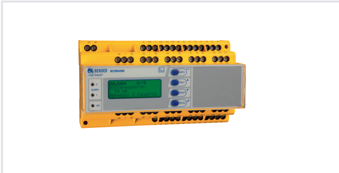
RCMS490 series ground fault monitor - MG-T.3