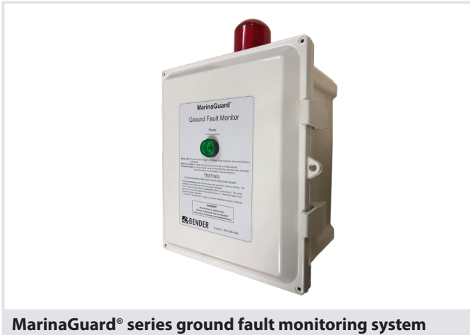
MarinaGuard® series ground fault monitoring system